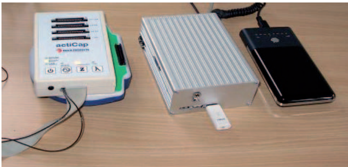
„eXtreme EEG Pack“

Let me give you an example of what we mean by that. What, do you think, happens in a table tennis player's brain when he fluffs a shot? Presumably what is known as ERN (Error Related Negativity) – but can we demonstrate that? The mere idea that the test subject would have to be moving as little as possible has caused researchers