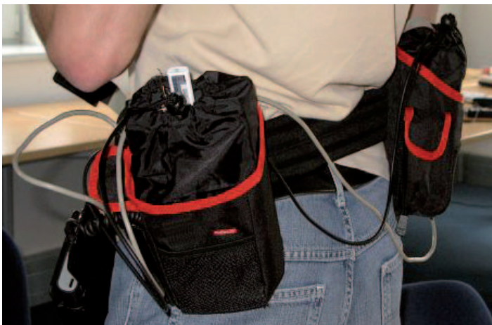
„eXtreme EEG Belt“